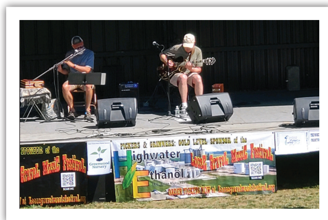
Highwater Ethanol - Loose Gravel Music Festival