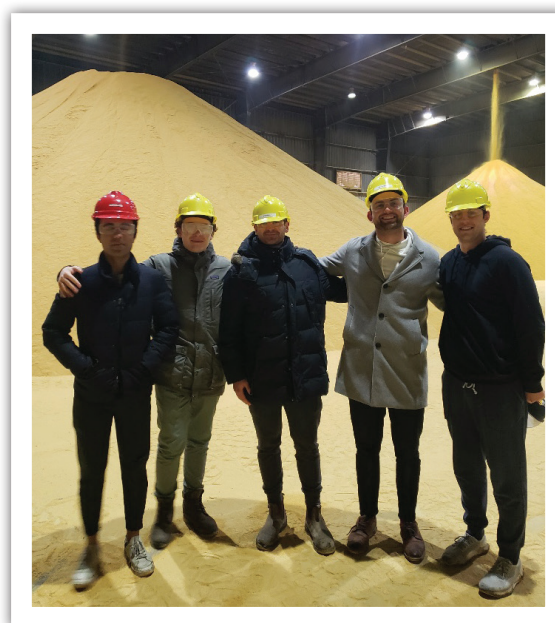
Tour Group at Highwater Ethanol